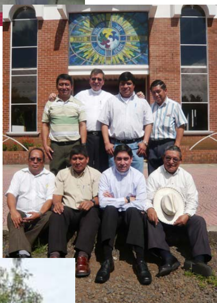
Meeting of priestly of Guatemala, November 2009