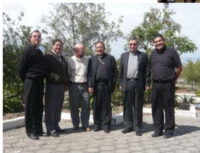
Bishop and Trainers visit Ecuador 2009