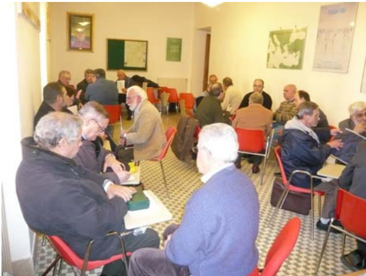
Sharing of deacons – Albano (Italy)