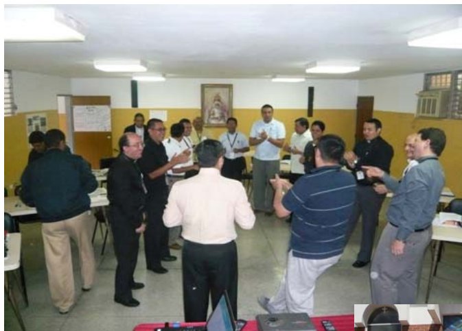
From the Pastoral Seminar of the clergy of Caracas-Venezuela