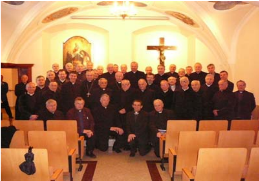
National AUC Assembly in Poland: 16 – 17 November 2009 Theme: “We are testimonies of Charity – renewal of the life of the shepherds”.